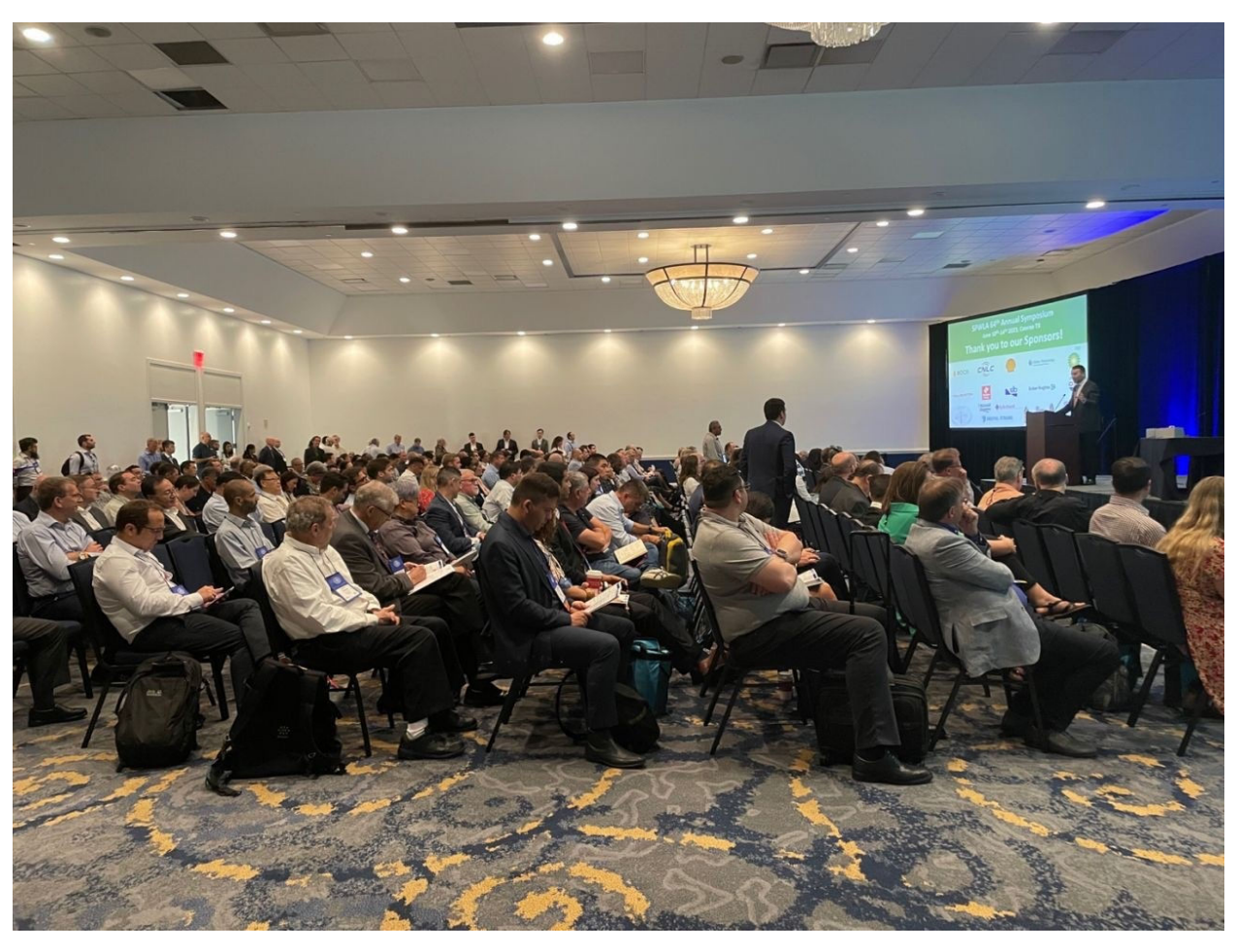
Opening ceremony of SPWLA 64th Annual Symposium hosted by Houston SPWLA chapter.