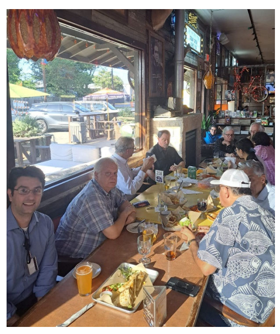
another fantastic networking event hosted by the SPWLA Houston Chapter on June 28th. We extend our heartfelt gratitude to all the attendees who made the event truly memorable.