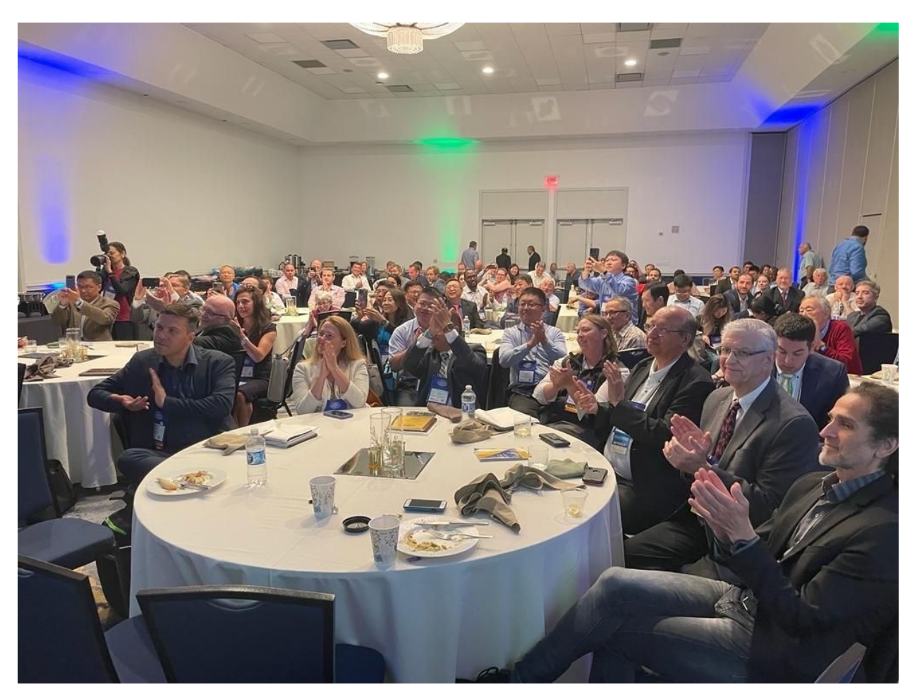
Awards luncheon of SPWLA 64th Annual Symposium hosted by Houston SPWLA chapter.

Opening ceremony of SPWLA 64th Annual Symposium hosted by Houston SPWLA chapter.