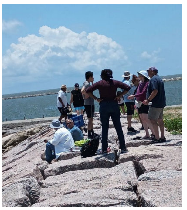
With great pleasure, Houston SPWLA chapter organized the SPWLA 64th Annual Symposium, including workshop and field trip.