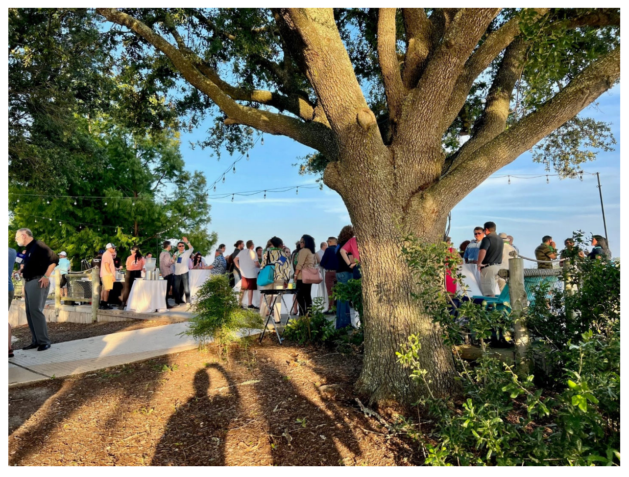
One of the social events of SPWLA 64th Annual Symposium hosted by Houston SPWLA chapter.