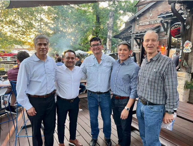
Houston chapter Networking time with guests. Happy to have current and past SPWLA international board members joing our event.